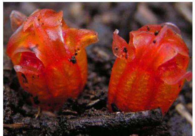
Thesium rodwayi , Fairy Lanterns

More rare plants have been discovered by