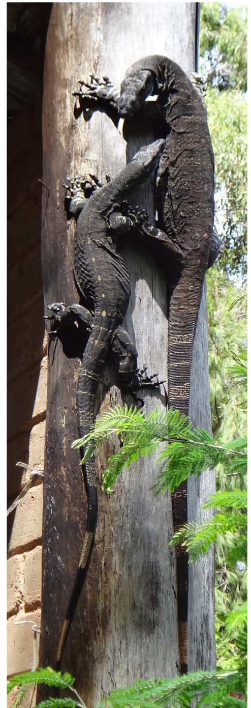
An amorous Goanna couple.

If you want to encourage these intriguing creatures you need to make your place 'wildlife friendly'. It is particularly important to keep aggressive and noisy dogs well contained away from where Goannas are likely to forage (a snake proof yard is also in the interests of your dogs survival). Goannas seem to quite happily co-exist with goats and other stock – realising that they pose little threat to them.